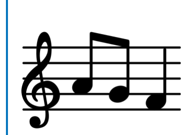
Calming music on the corridors